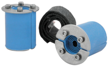
RS PPS seal